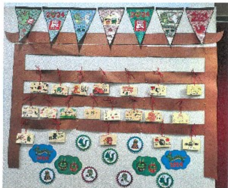
Year 6 ema wishing plaques