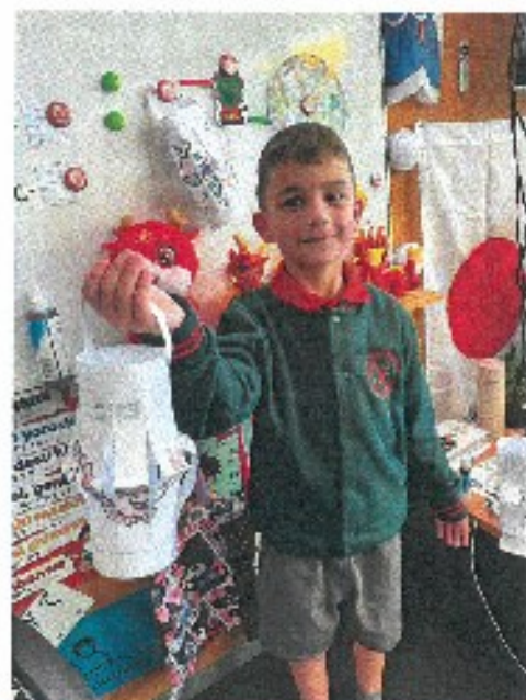
Year 2 Year of the Dragon lanterns